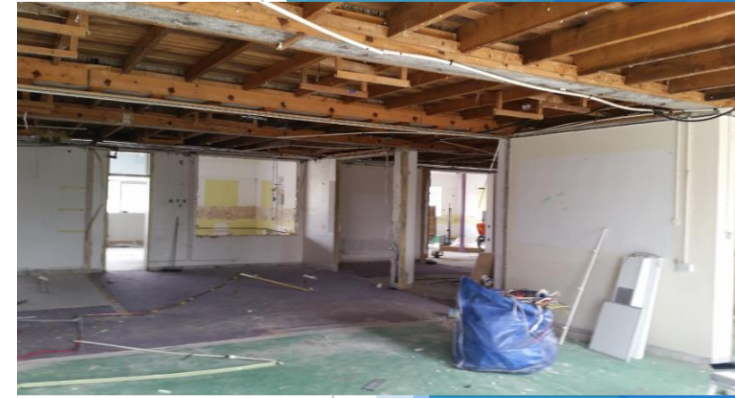
The Trust Offices – Before and After