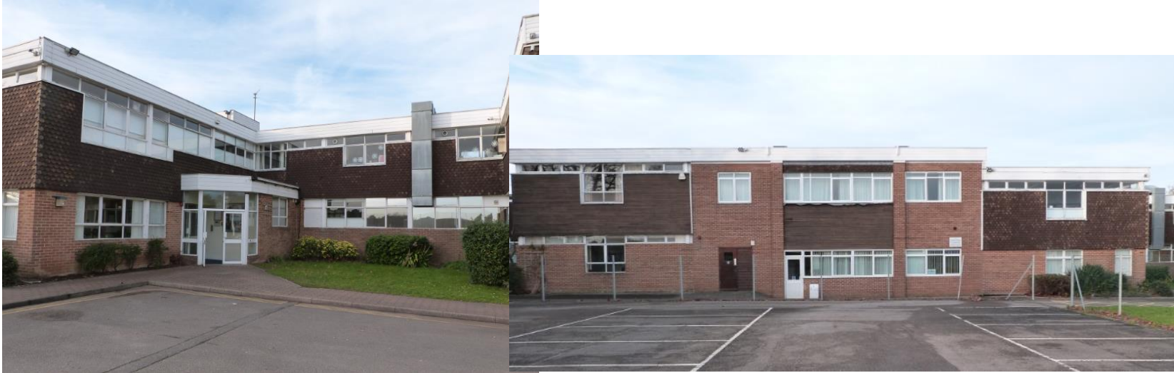
Petersfield Academy – Before and After